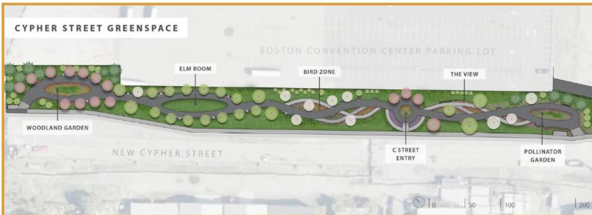
Cypher Street Greenspace