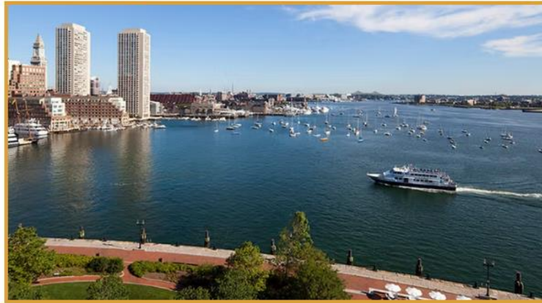
Fan Pier Park