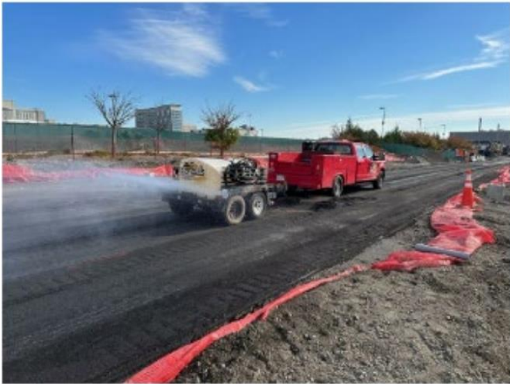
Water misting during milling