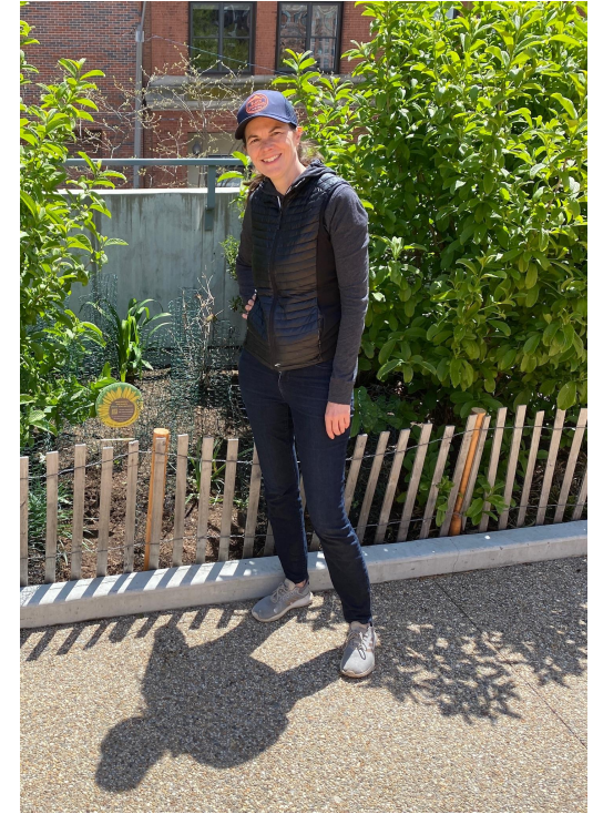
One of our volunteers who planted this patch of sunflowers

If any of these opportunities resonate with you, please take a moment to fill out our survey here: https://forms.gle/UsH5qMtkyf9TFApn6