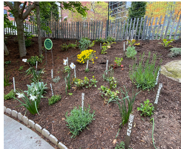
(left) herb & medicinal plant garden